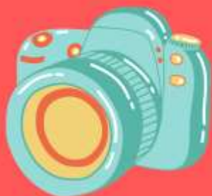
PHOTO CONTEST AWARDS

November 1 st , 15 th , & 29 th from 12 to 4 pm