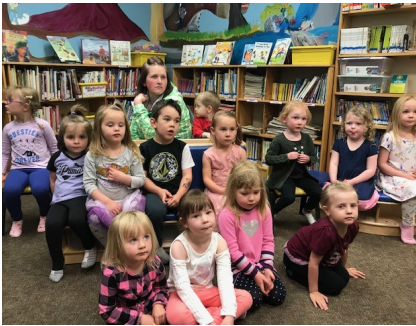
Preschool tour at the library.

Our Mission: To be an integral part of the community by meeting the needs of patrons and to develop and expand the library's tangible, virtual and technological resources.