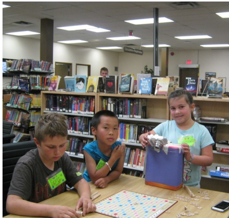
Summer Reading Club fun.