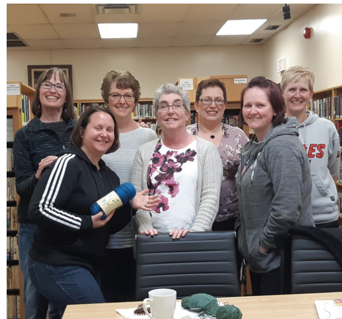
Knitting in public.

Elkford Public Library 816 Michel Road Box 280 Elkford, BC, V0B 1H0 Phone: 250-865-2912 Fax: 250-865-2460 info@elkfordlibrary.org https://elkford.bc.libraries.coop