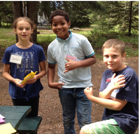
Summer Reading Club fun.